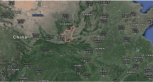
Figure 1.The location information of weinan, shanxi, china

This comparison test is proposed to evaluate the variations in the performance of Tiger Neo n-type bifacial module 560W and conventional p-type bifacial 540W in a 100MW project in Weinan, Shanxi Province, north West China (Latitude: 34 ° 50 N, longitude: 109 ° 50 E). The solar irradiance at the site is 1436 kWh/m 2 , and the ambient average temperature is about 13 ° C. In this research, the performance ratio and different power losses just like soiling, PV module losses, inverter, and losses due to temperature are taken into account and calculated by using PVsyst.